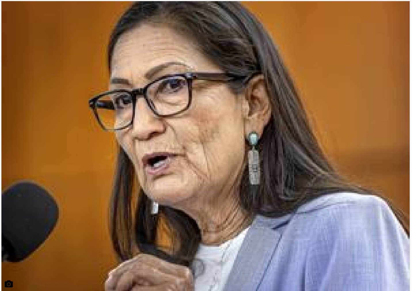
Q&A: Governor and lieutenant governor candidates on public safety

Q&A: Governor and lieutenant governor candidates on child welfare